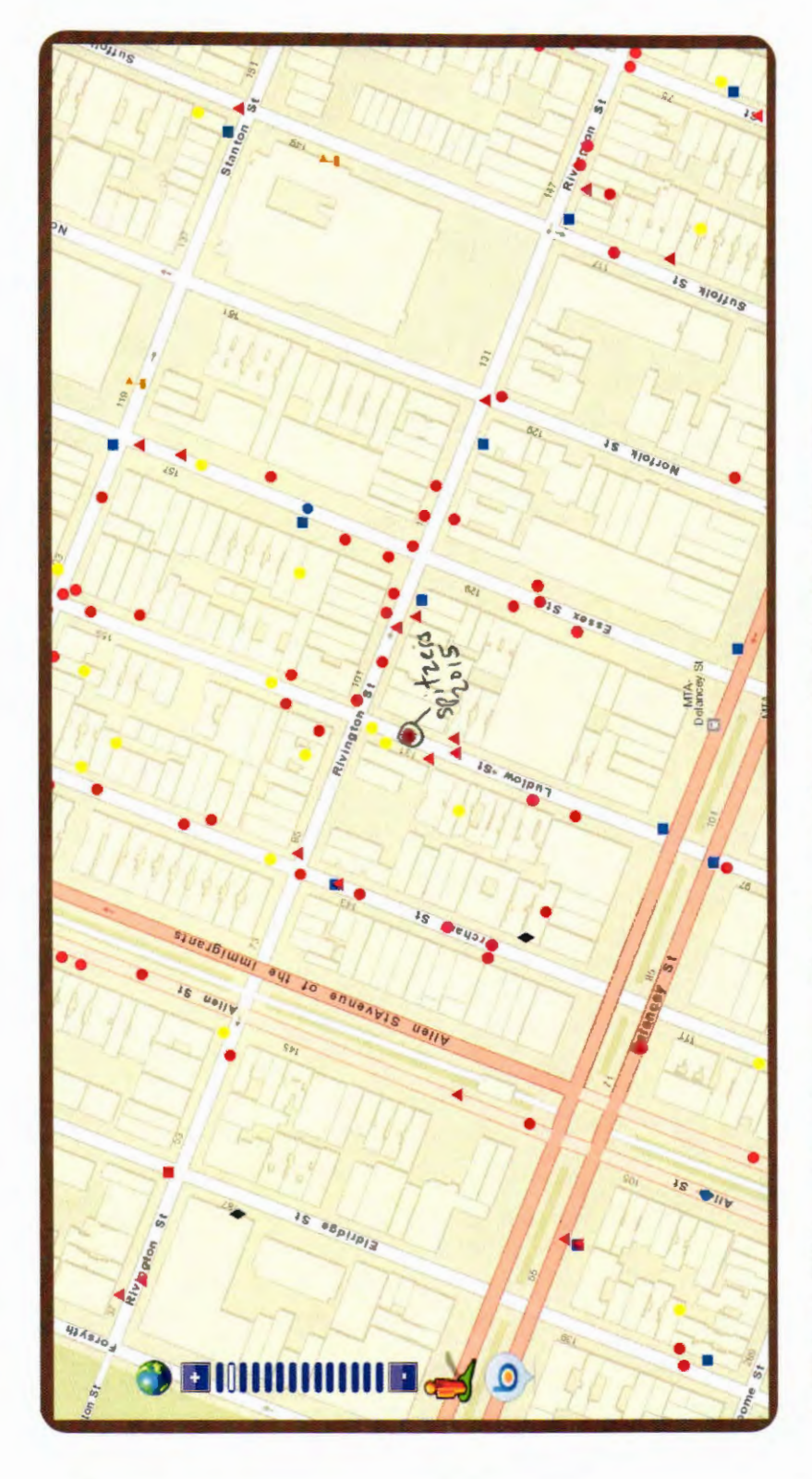
Disclaimer. The NYS Liquor Authority is not responsible for the accuracy of maps or data obtained from third party sources.